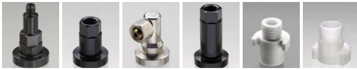
22A 23A 24A 25A Quick-Connect adapter #21880 Quick-Connect adapter #21752