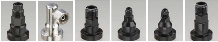
9A 10A 11A 12A 14A 15A