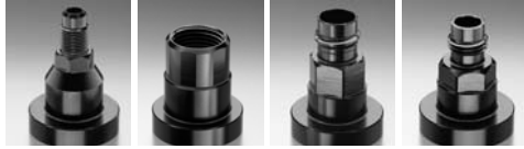
31A 32A 37A 43A