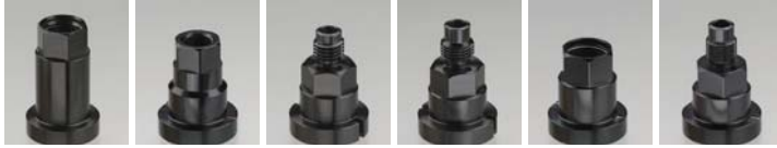
2A 4A 5A 6A 7A 8A