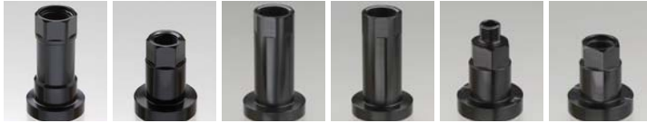
16A 17A 18A 19A 20A 21A